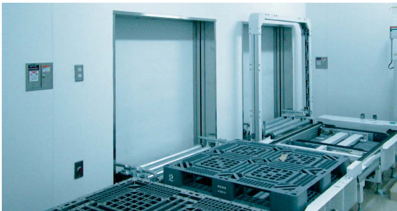
EFA-HVS CR in a material airlock

EFAFLEX clean room doors are optimally suited for conveyor systems between plant sections and storage rooms. CR Series high-speed doors are also used in high rack warehouses and inertisation applications.