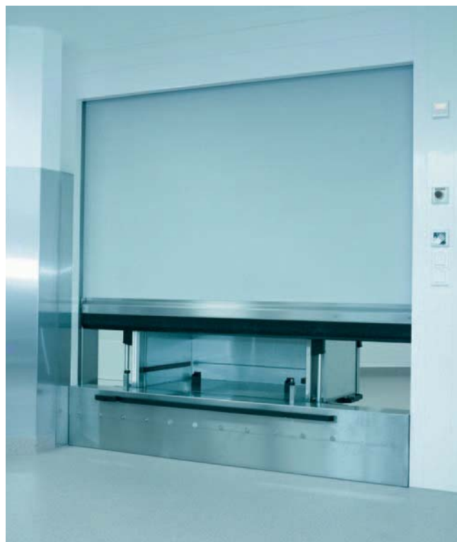
EFA-SRT® CR Premium in the sterile department of a clinic

It is often necessary to link two doors to an airlock – for this, we have again various options here for you too. Whether as an airlock between the exterior space and the clean room or between different clean rooms. Combine the two high speed doors with the respective special advantages of EFAFLEX to the suitable solution. Depending on the spatial installation possibilities, different airlock combinations are possible. Your EFAFLEX consultant is happy to advise you.