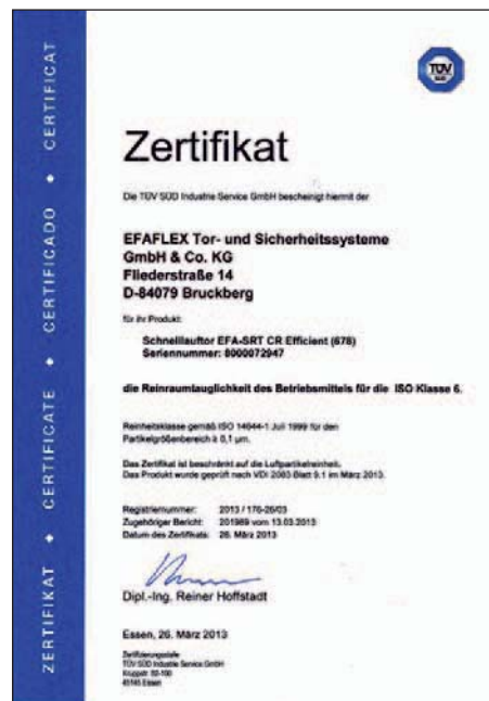
EFA-SRT® CR Efficient