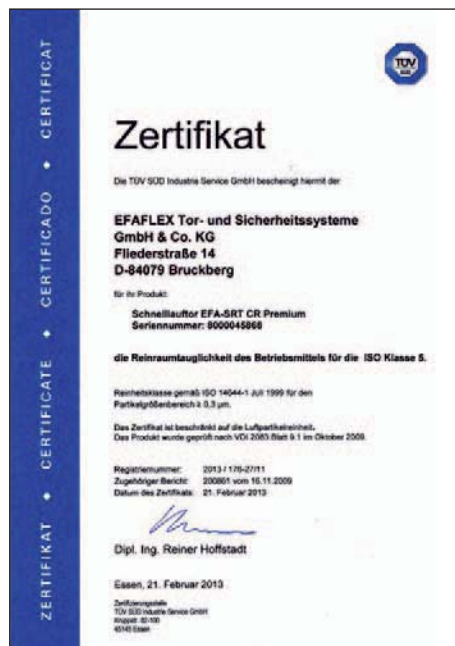
EFA-SRT® CR Premium

The EFA-SRT® CR roller doors are TÜV approved and clean room compliance has been certified up to ISO class 5 and 6 according to EN ISO 14644-1.