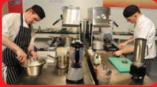
La Parade des Chefs