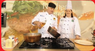
Live Hot Kitchens with Good Food NI