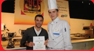
Chef Skill & Salon Culinnaire

Here are just a few of the exciting features taking place at the show: