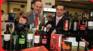
Product of the Show Awards